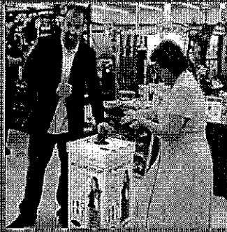
Fluorescent Lamp Recycling Partnership in the City of Napa.