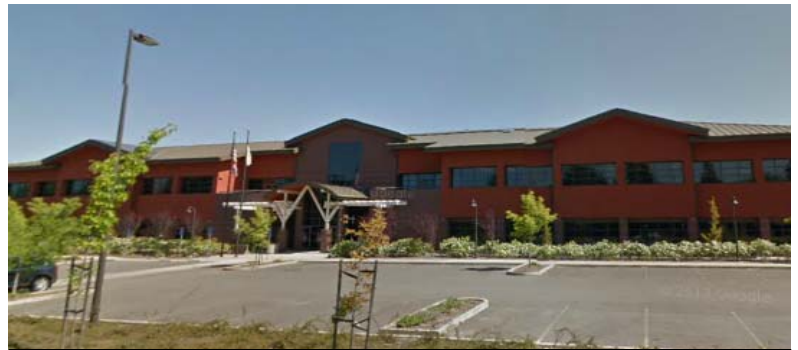
Administrative Center Building